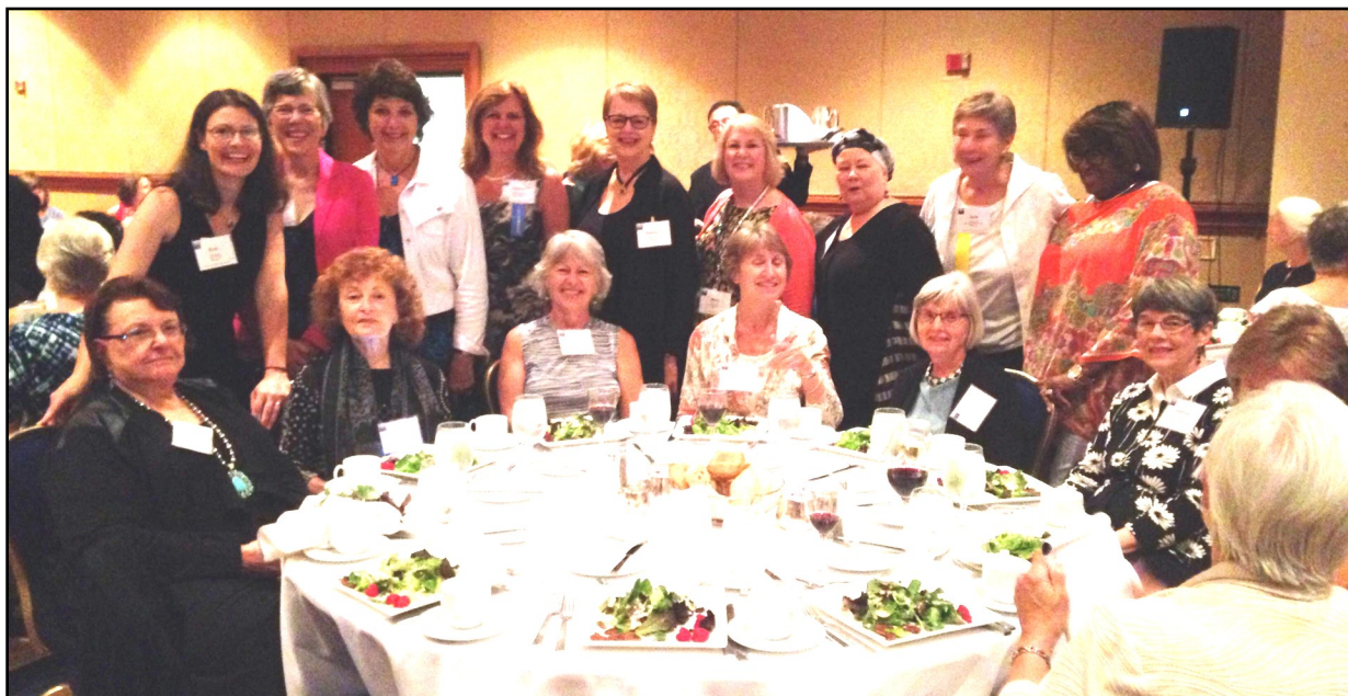
Wisconsin delegates to LWVUS Convention