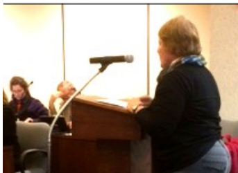
President spoke at Appleton public hearing on several budget issues, including support for Diversity and Inclusion Coordinator position.

are more obscure, but we know at this election more than ever they would happen. A big thank you to all who did their part at the polls on Nov 8, as well as before the election.