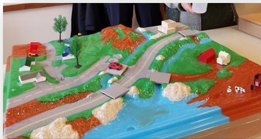
Model used by LWVLMR to demonstrate how watersheds work.

Four individual grants (one for each lake – Lake Winnebago, Lake Poygan, Lake Butte des Morts and Lake Winneconne - were awarded to finalize