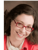
Representative Rachael Cabral-Guevara, Assembly District 55