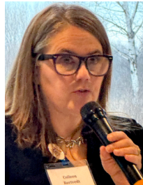
Colleen Rortvedt Appleton Public Library