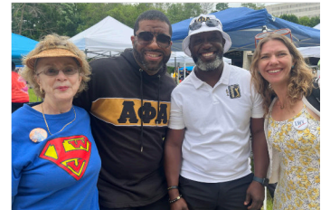
The League participated in Juneteenth in partnership with the Alpha Phi Alpha chapter.

The team offers this informal list of upcoming community events, and welcomes additional entries to be sent to dei@lwvappletonfoxcities.org