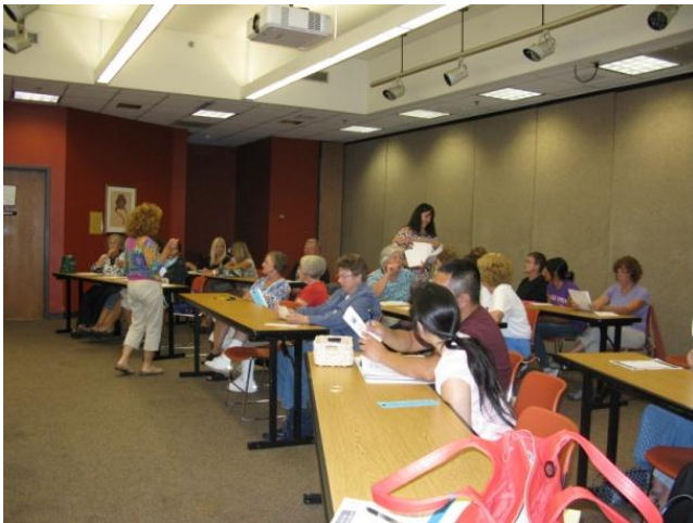
Women's Health Issues Discussion, September 12, Appleton Public Library

Websites of interest: www.raisingwiwomensvoices.org www.supportwomenshealth.com