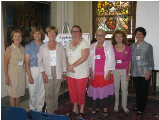
Women's Equality Day Committee